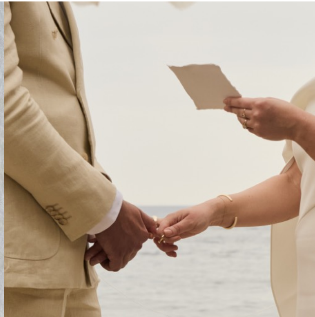
Your Story, Our Focus